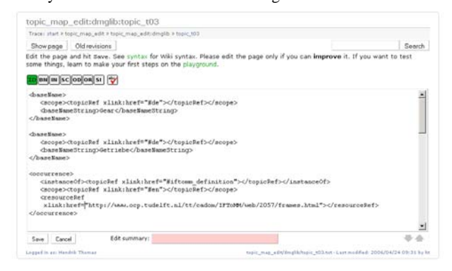
Figure 2: Editing section of TMwiki

The editor of TMwiki helps users to upload and edit any XTM compliant Topic Map. Several short-cut-buttons (see Figure 2) support the design of a well-formed Topic Map. TMwiki also checks the edited code and validates it on the basis of the XTM version=1.0 DTD. If a topic map has an error, a message is displayed in the upper field of the editing screen. The revision history allows users to track recent changes.